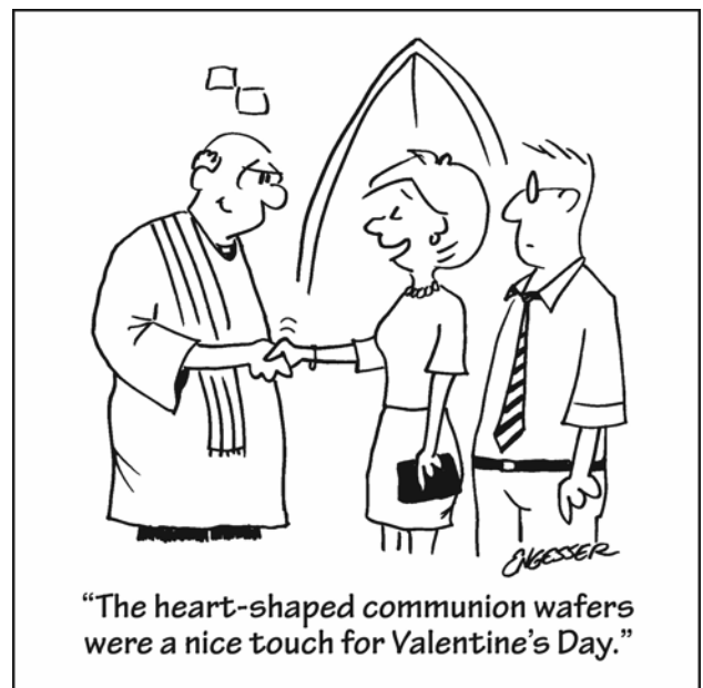
"The heart-shaped communion wafers were a nice touch for Valentine's Day."