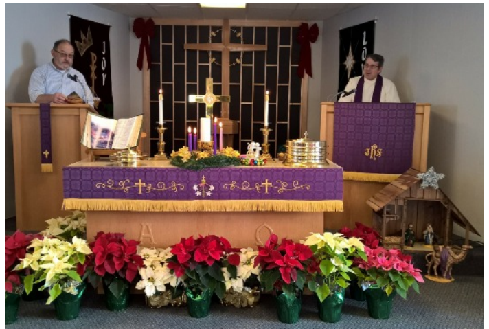
The altar decked out for the Christmas season.