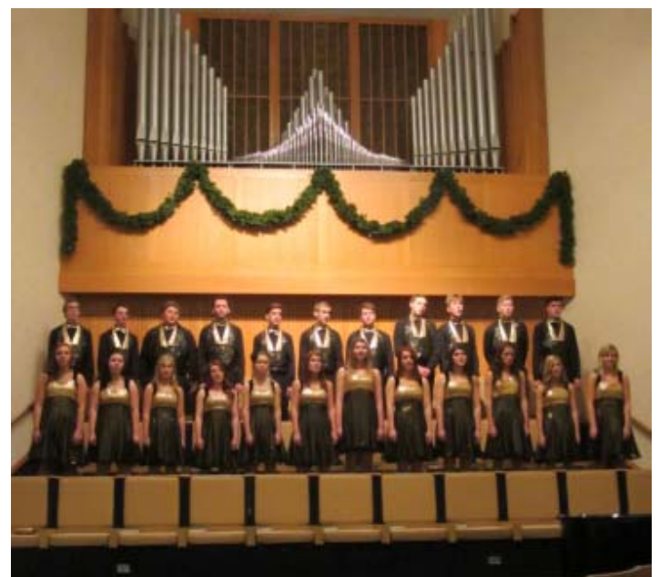
Soiree Singers from Bedford High School entertained the Good Bunch in December.