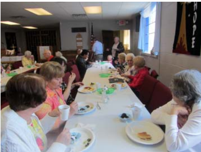
The Faith family enjoying luncheon together at a recent free-will offering luncheon.