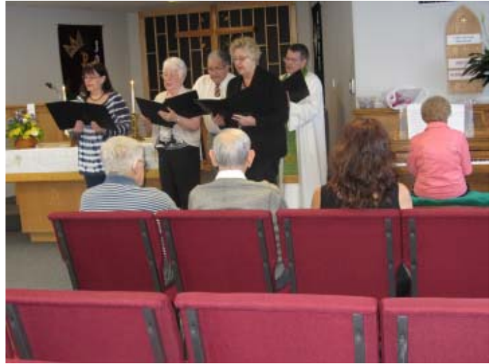
The choral group performs.