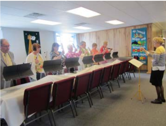
A chimes group performance.