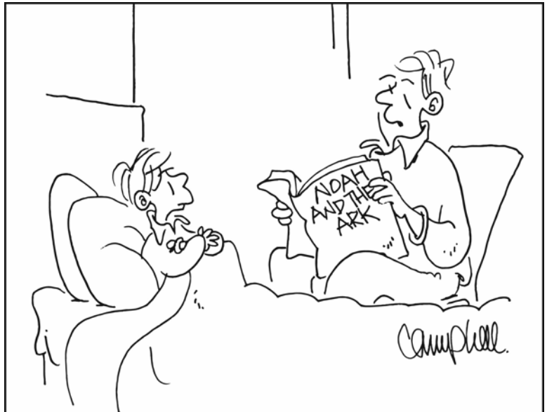
“... And after he saved the animals, he started turning up on the mailing lists of environmental organizations.”

For all copy and photos for the November issue of the Dialog is Thursday, October 24.